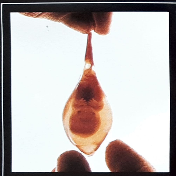
6-7 weeks after conception

The baby's heart has been beating for three weeks / all vital organs are present / fingers, feet, toes are developed / arms, legs move / sex can be determined / brain waves can be detected.